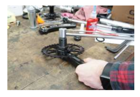
Fig.4 Tighten locking ring