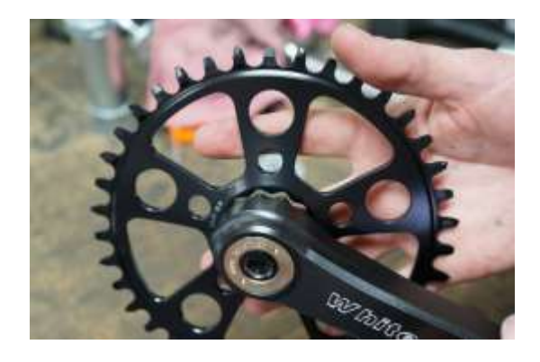
Fig.3 Install ring

2. Install chainring(s) onto drive side arm. (fig 3) Grease threads on the locking ring and install. Tighten down the locking ring to 40 Nm using the BBT-22 or BBT-32 tool. (fig 4)