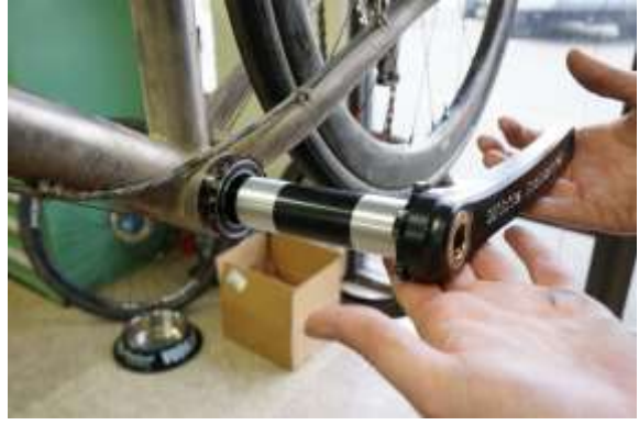
Fig.6 Installing spindle w/ arm in place.

4. Install the drive side arm. Be sure that the drive side arm is clocked 180 degrees from the non-drive side arm. (fig 7) Next, using a 10mm allen wrench torque the drive side bolt down to 48-54 Nm. (fig 8) Do not be shy about torqueing to spec.