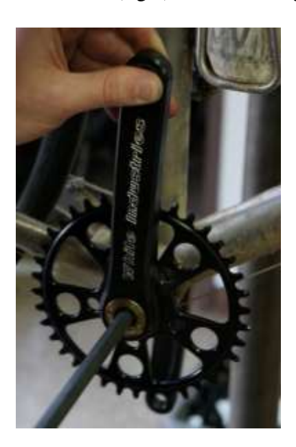
Fig.7 Crank arms clocked 180 degrees

4. Install the drive side arm. Be sure that the drive side arm is clocked 180 degrees from the non-drive side arm. (fig 7) Next, using a 10mm allen wrench torque the drive side bolt down to 48-54 Nm. (fig 8) Do not be shy about torqueing to spec.