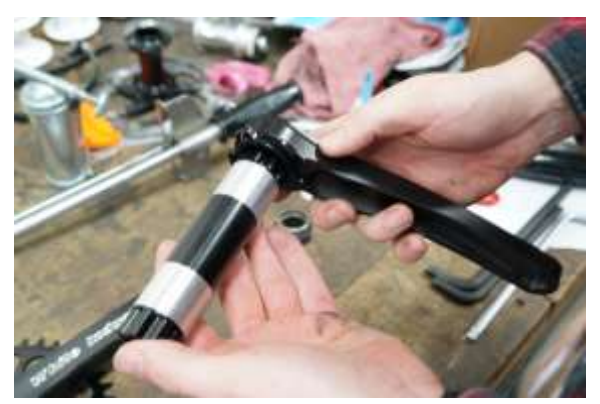
Fig.5 Mating spindle to arm

3. Mate, by hand, the spindle to left arm. (fig 5) grease the spindle then slide it in from non-drive side, through BB shell, to drive side.(fig 6)